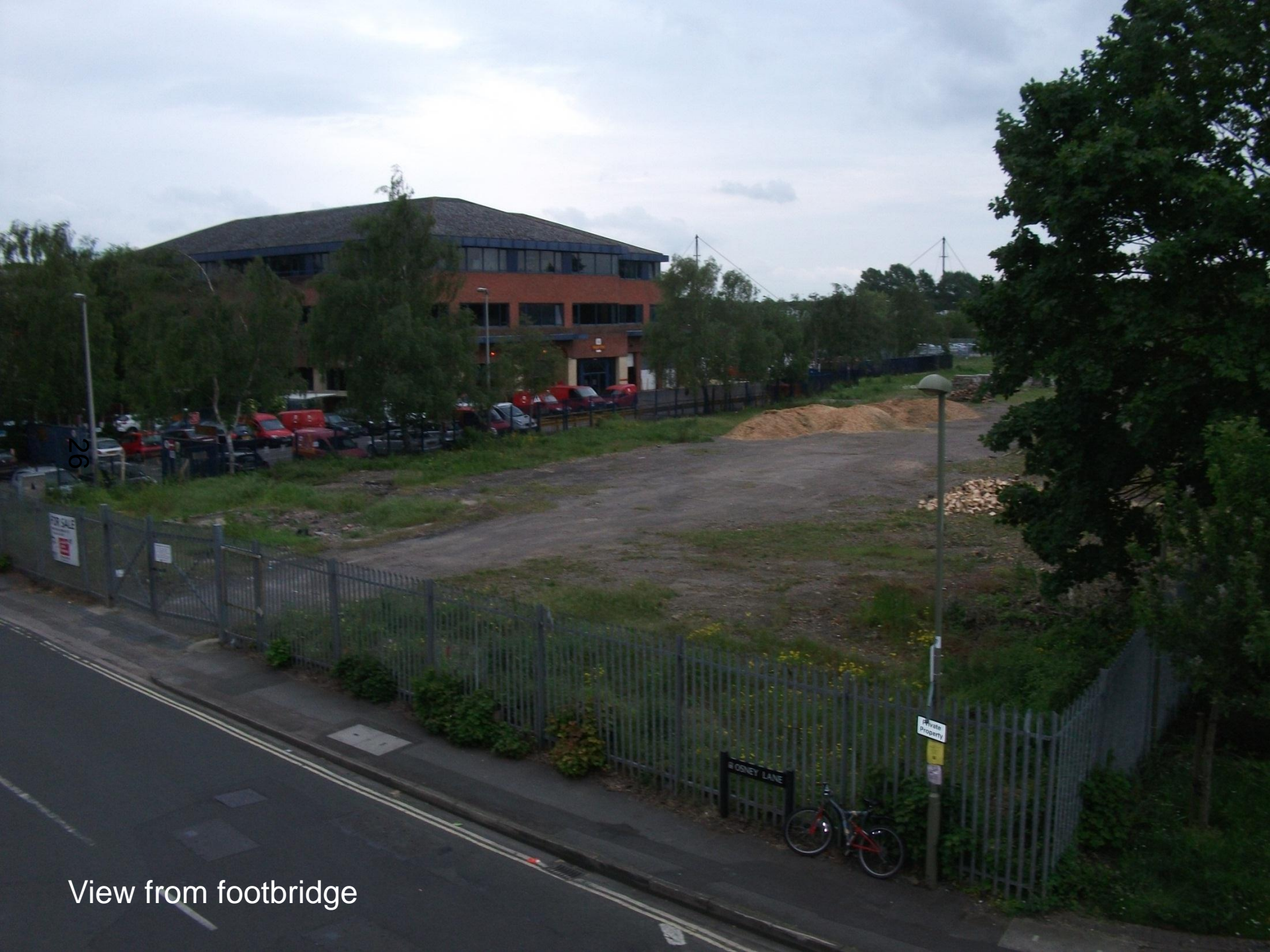
View from footbridge