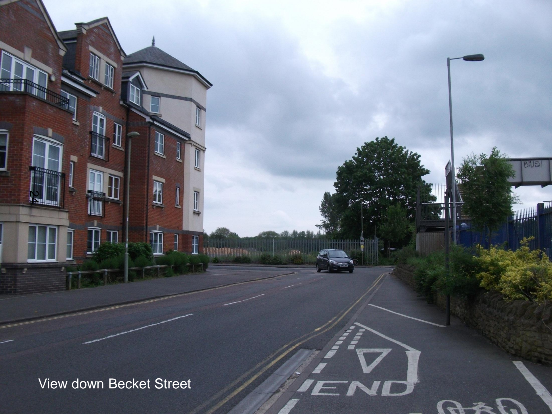
View down Becket Street